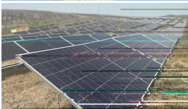
Figure 1: Project Picture